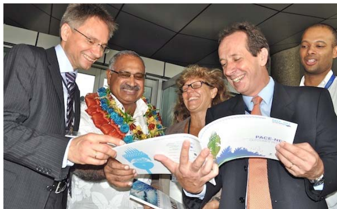
European Union's Fiji's Ambassador Andrew Jacobs and Minister for Local Government Samuela Saumatua are flanked by researchers from the region at the PACENET Stakeholder Conference

"Natural hazards such as cyclones and floods are occurring at quite a frequent rate in the region, an example is the recent Tropical Cyclone Evan and major floods we faced last year," the minister said.