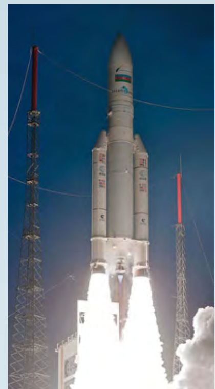
Launch of the first Azerbaijan telecommunications satellite Azerspace-1 from Kourou, in South America, the Space Center of French Guiana

International organizations are rather optimistic about the development prospects of the ICT sector in Azerbaijan, believing that continuation of sector reforms and, in particular, the establishment of preferential environment for potential investors in 2025 will bring the level of income from the ICT sector to 10% of GDP. It is comparable with the expected level of profitability of sector in the developed countries of the world.