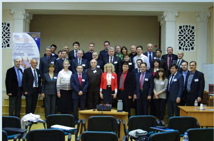
The participants of the Moscow workshop

The workshop was aimed to validate the first findings about the ICT Policy Dialogue Picture, provided in the draft of the Roadmap and to define the most relevant pilot actions to be implemented during PICTURE project. The event has been attended by consortium partners, the EU and EECA ICT stakeholders, including IT high-level specialists, and top researchers.