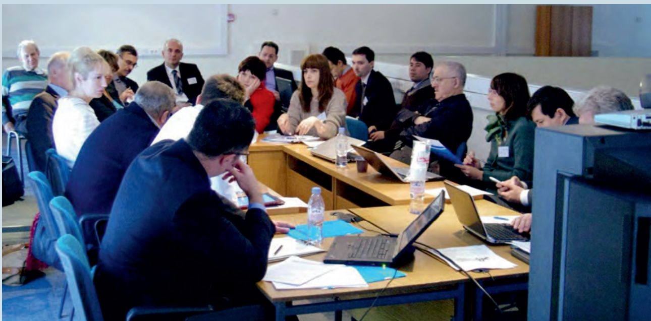
Working Group 3 (Content Technologies and Information Management) session