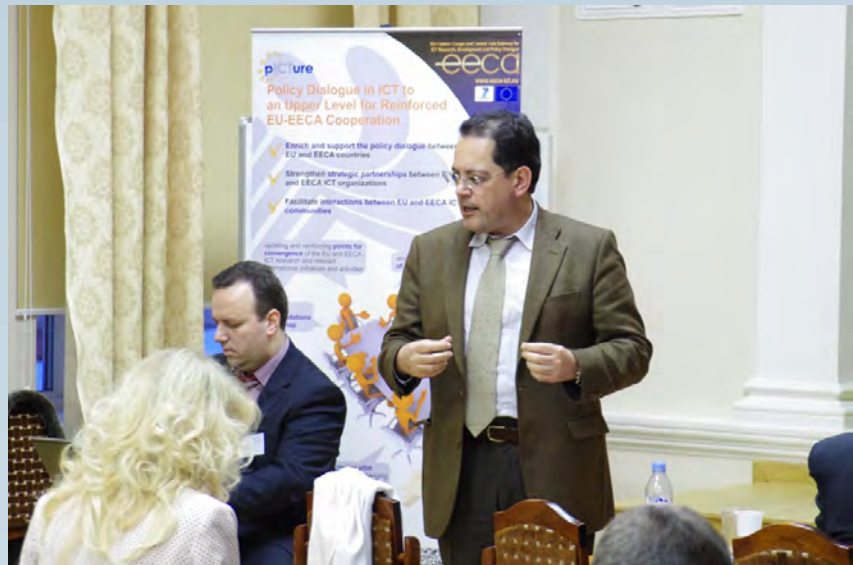
Vassilis Kopanas, DG CONNECT

Meetings of the three Working Groups were held in parallel to Validation workshop. The objectives of these three meetings were transversal: to discuss with the experts the Draft of The Roadmap and proposals for pilot actions in order to select the most relevant actions addressing interests of the EECA countries. As a result experts provided valuable recommendations on the criteria for selection of actions they should focus on.