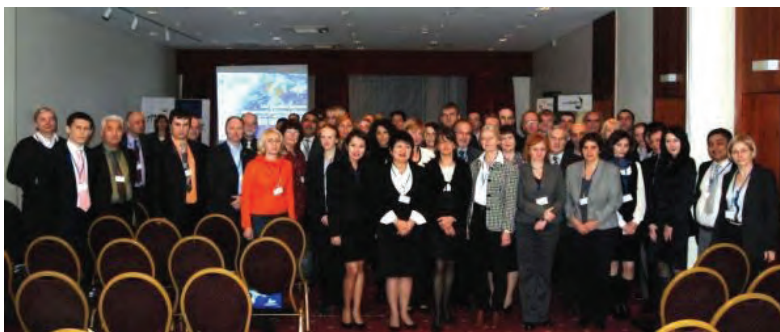
Participants at an IncoNet EECA Policy Stakeholders' Conference in Warsaw in 2011

Please also read the article about previous events in the series of Policy Stakeholders' Conferences.