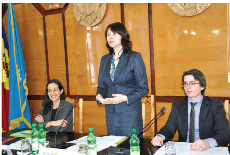
Presenting the publication 'Skilled Migration and Development Practices: Republic of Moldova and the Countries of South East Europe'

On 7 February 2014 the scientific publication ' Skilled Migration and Development Practices: Republic of Moldova and the Countries of South East Europe ' has been officially launched within a public event at the Academy of Sciences of Moldova.