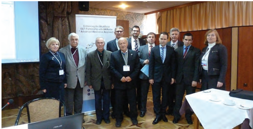
Participants at the UNTPAM launch event

The event gathered more than 80 participants from the National Academy of Sciences of Ukraine) and branch institutes, Ukrainian universities, industrial entities and public organisations.