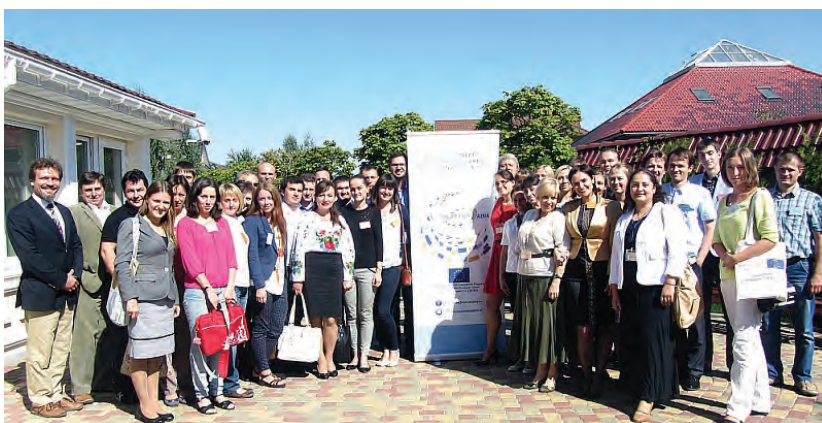
Participants of the BILAT-UKR*AINA Summer School