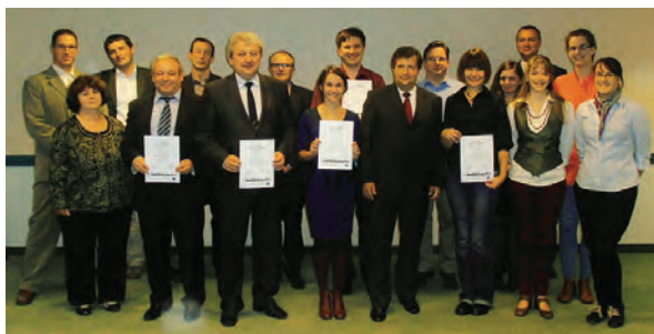
ICT training in Budapest

Following the Summer School on RTDI policies & instruments held in Kyiv, RCISD – the Regional Centre for Information and Scientific Development – organised an ICT in-house training for experienced Ukrainian researchers and research project managers in Budapest. The training took place on 6-7 October 2014, with the aim to offer intensive training for just a few of the best or most promising Ukrainian researchers of top-level Ukrainian RTDI organisations, as well as to increase their likelihood of participation in RTDI projects with European partners.