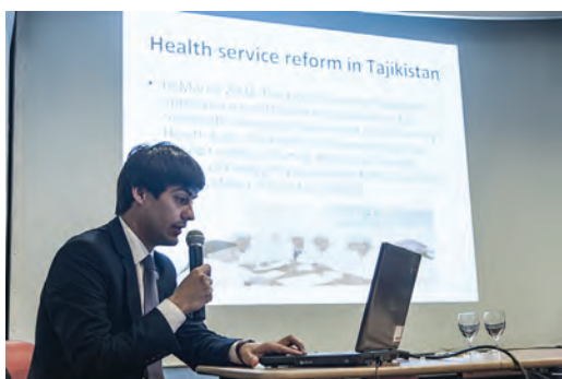
Health Workshop