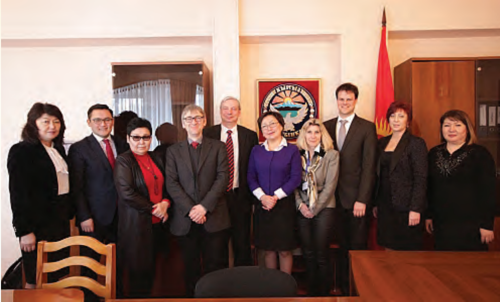
Hosts and experts at the White House in Bishkek

The team of international experts conducting the mission to Kyrgyzstan consisted of: