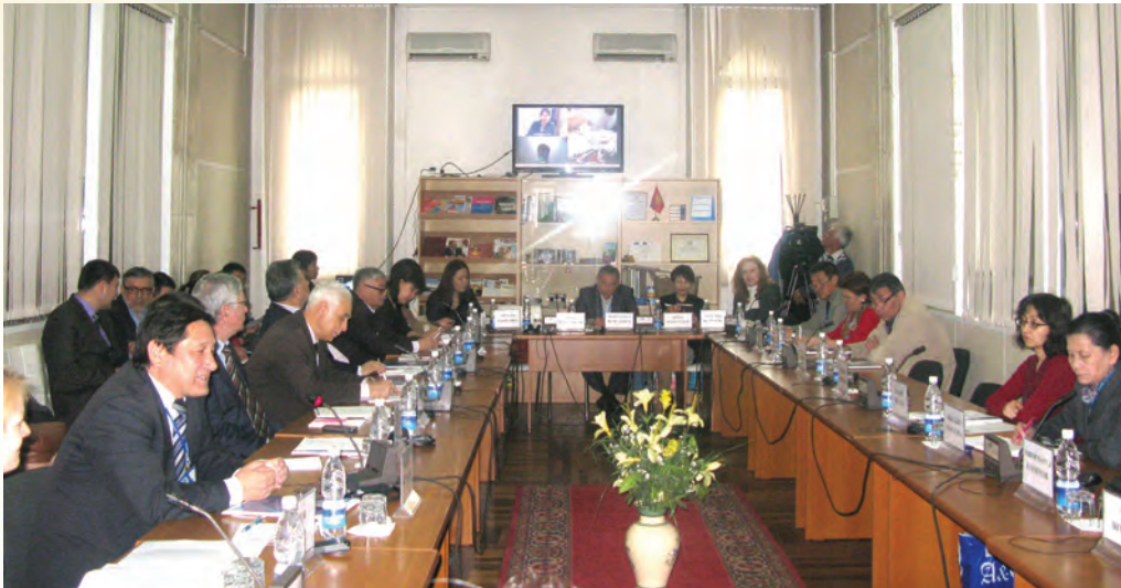
Horizon 2020 Info Day in Bishkek on 15 April 2015

On 15 April 2015 the National Coordinating Center of Horizon 2020 in the Kyrgyz Republic held an Informational Seminar on the European Union's Framework Programme for Science and Innovation 'Horizon 2020'. The main objective of the seminar was to strengthen the involvement of the scientific community of Kyrgyzstan in 'Horizon 2020' research projects.