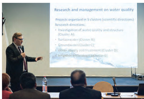
Climate Change Workshop

The main objective of these events was to inform EU researchers about the research landscape in Eastern Partnership and Central Asian countries, to build inter-regional networks, and last but not least to build up new contacts and potential project consortia to participate in Horizon 2020 calls. This last objective was supported by several bilateral matchmaking talks organised by Euresearch, Switzerland as a part of the three-day event. Participants of the side-events highly appreciated both the content of the STI Days and networking possibilities during the conference.