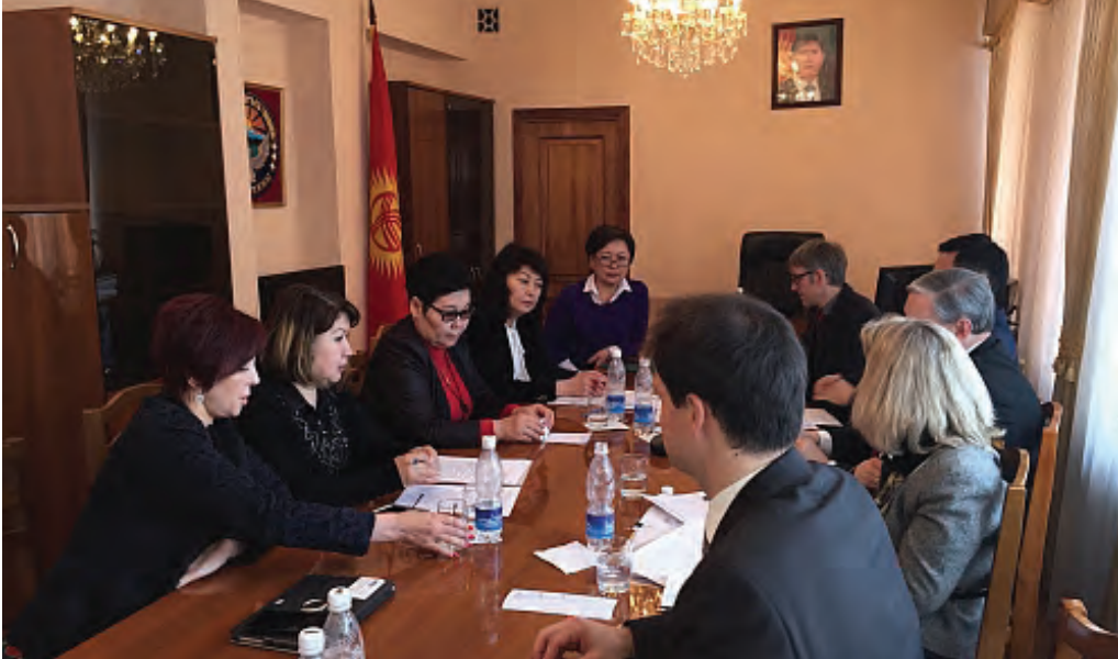
Photos on this page: work meetings during the Policy Mix Peer Review

paid to the issues of Human Resources, Economic and Market Development, the Scientific Basis and the sector of Business R&D and Innovation.