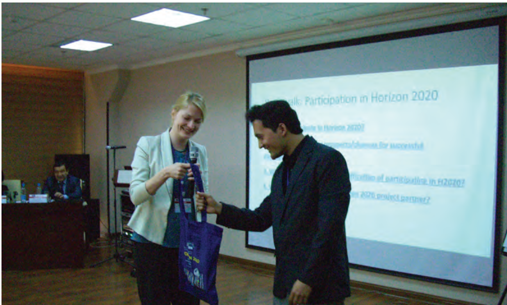
Horizon 2020 Info Day in Tashkent on 17 April 2015

The speakers also presented information on Horizon 2020, the EU Framework Programme for Research and Innovation, the Participant Portal, information on how to be involved and find partners, and twinning grants and discussed issues regarding the developing of cooperation between scientists and specialists of Uzbekistan and the EU.