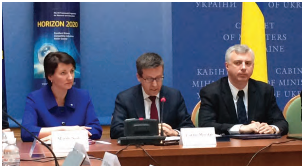
Impression from the meeting in Kyiv

Researchers, businesses and innovators from Ukraine will now be able to fully participate in Horizon 2020, the European Union's research and innovation funding programme, on equal terms with EU Member States and other associated countries. This is thanks to the Agreement for the Association of Ukraine to Horizon 2020, signed on 20 March in Kyiv by Carlos Moedas, European Commissioner for Research, Science and Innovation, and Serhiy Kvit, Minister of Education and Science of Ukraine.